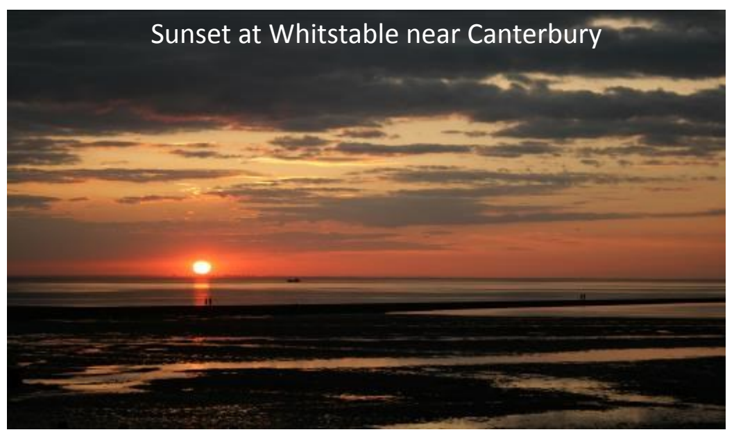
See you soon!!

Of course, there are also lots of different shops in Canterbury which is only a 15 minute walk away!